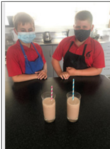
Lime or Chocolate Milkshakes