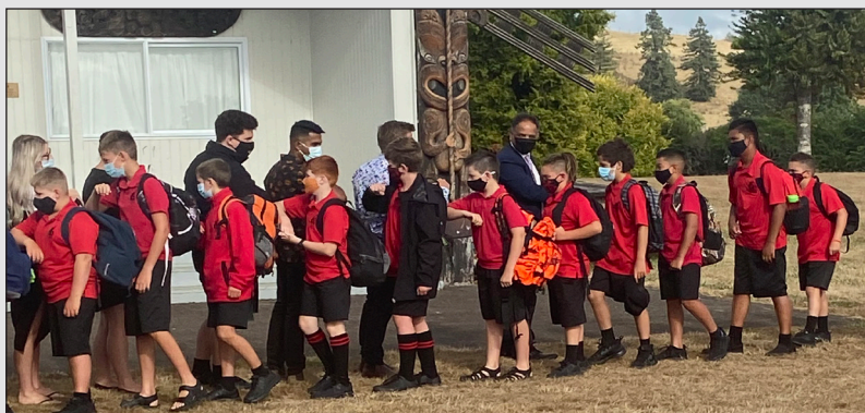
Our new students hongi Piopio College staff at pōwhiri

We hope that they enjoyed their introduction, or that you got to see some of the stained glass cookies, the wooden tray, and the print making.