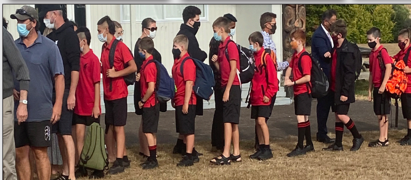
Orientation Day photos - Page 3