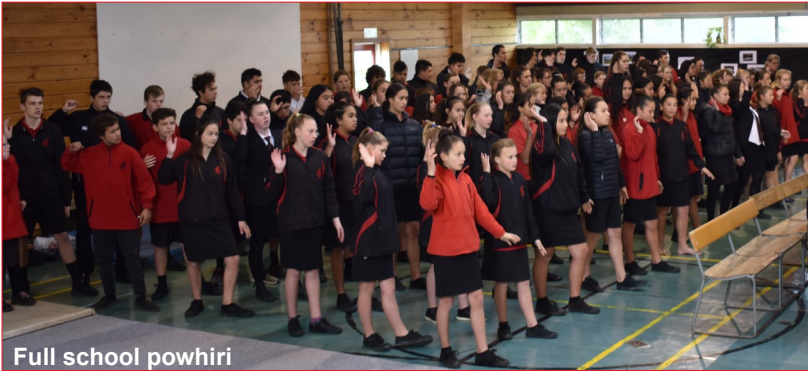
Full school powhiri