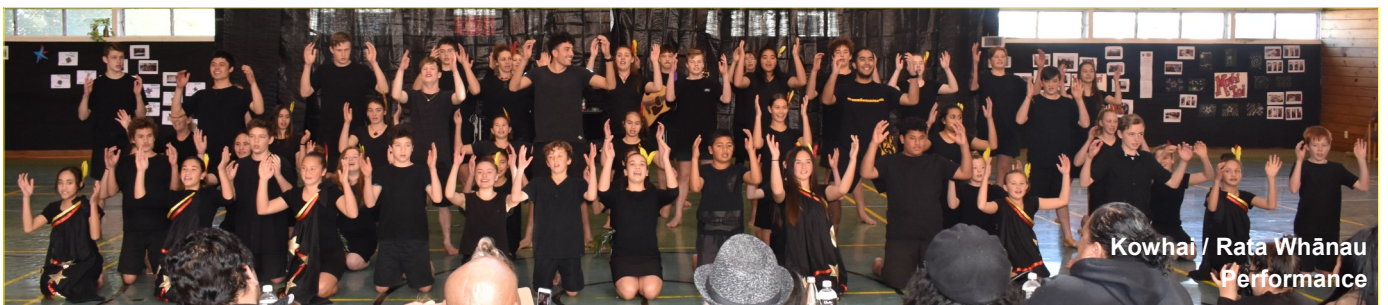
Kowhai / Rata Whānau Performance