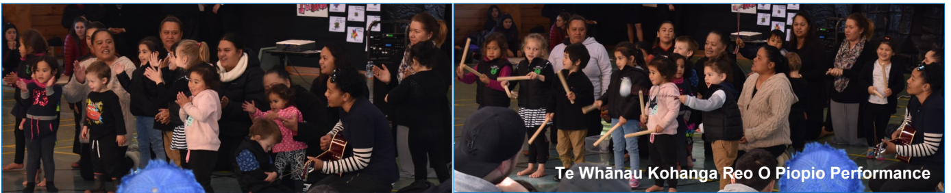
Te Whānau Kohanga Reo O Piopio Performance