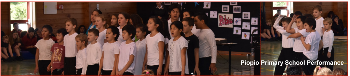
Piopio Primary School Performance