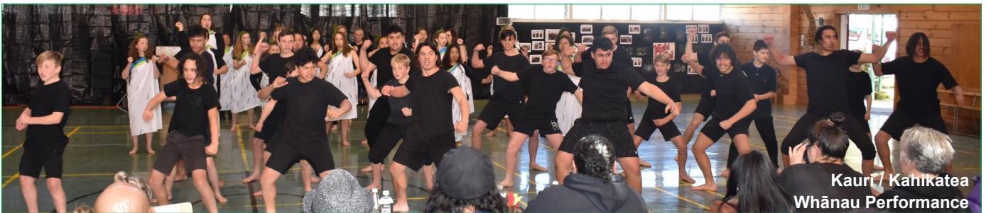
Kauri / Kahikatea Whānau Performance