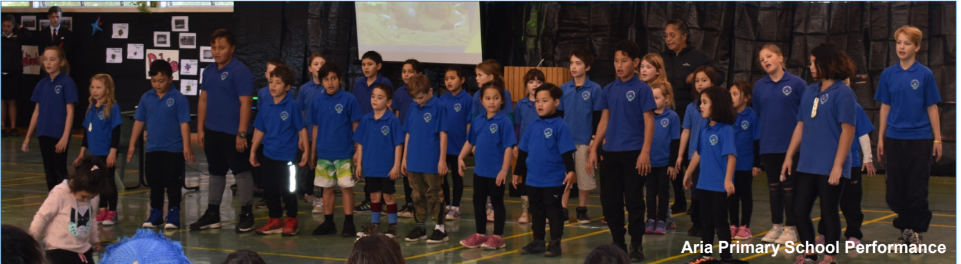
Aria Primary School Performance