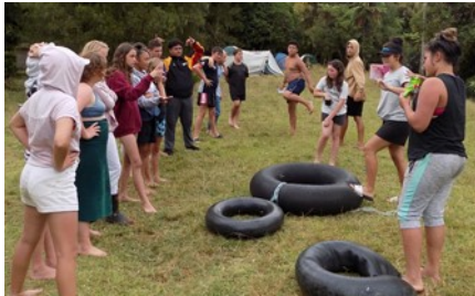
AMAZING RACE—ORGANISED BY LAYKEN & POTAHU