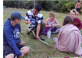
HEATH & CO— EEL BOBBING