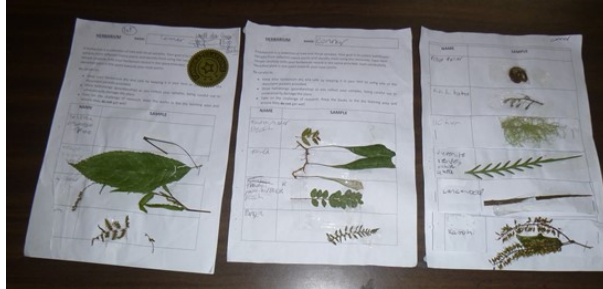
THE WINNING HERBARIUM